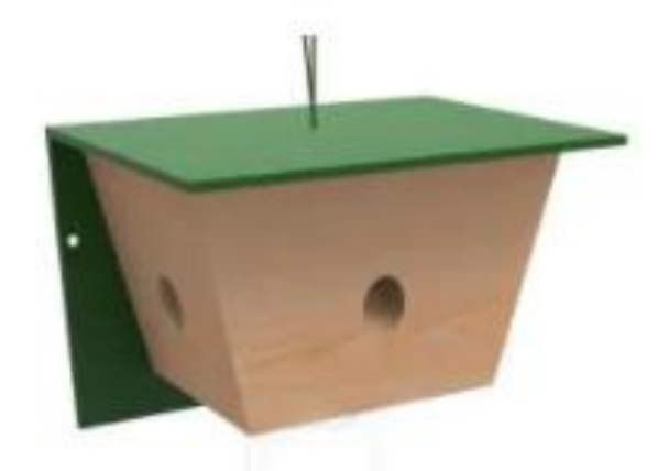
Carpenter Bee House